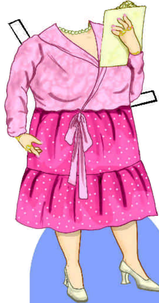
The High Inquisitor