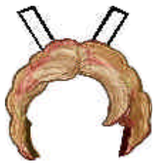
A fussy pie frill at her neck